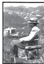
Right: King Vidor on location during the taking of one of his pictures. (Vidor is a director).

hardwood, is just to port of the ship's centerline, and on the shelf forward of the wheel, are complete engine controls, including two custom made control units finished in chromium plate, which handle the reverse gears, gasoline throttles and spark adjustments. The finish is beautifully done in teak, and mohair settees, both port and starboard of the companionway which leads aft, contribute greatly to the pleasing appearance of Runaway's pilot house.